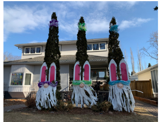
This photo and the photos on page 7 are by Paula E. Kirman. You can visit her photo blog at: westendstreetphotos.com