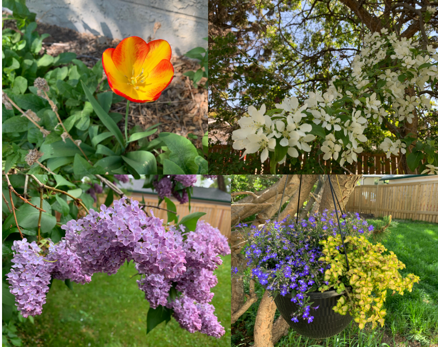
Photos by Paula E. Kirman. You can visit her photo blog at: westendstreetphotos.com