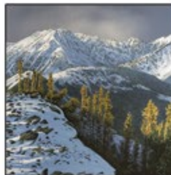
W.H. Webb • October 17 - 29