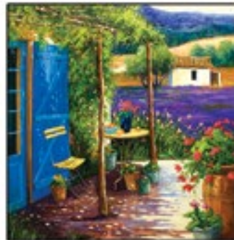
Robert Savignac • Sept 26 - Oct 8