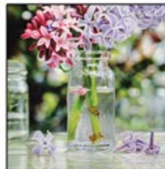
Glen Semple • November 14 - 25