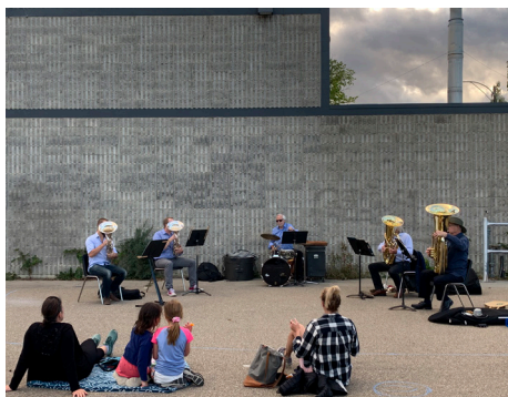
The ESO performed outside Parkview hall on September 11th.

Parkview Community League relies on your support and participation! Only 1 in 5 households are PVCL members, yet everyone benefits from a strong Community League. Get your membership from Tracey at info@pvcl.ca or online at efcl.org .