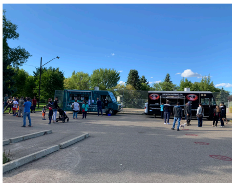
Food Truck event on August 29th.