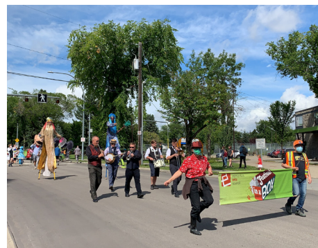
The Edmonton Arts Council's Festival in a Box came to Parkview on August 22nd.