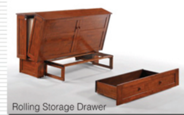
Rolling Storage Drawer