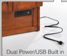
Dual Power/USB Built in