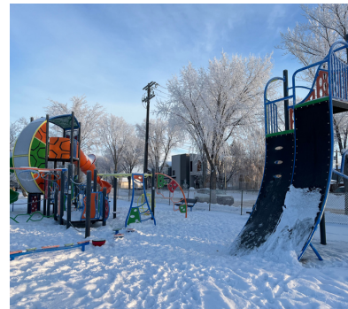
Photos by Paula E. Kirman. You can visit her photo blog at: westendstreetphotos.com