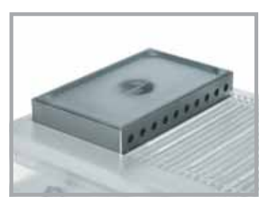
SGC-SP12 Stainless Steel Steamer Pan