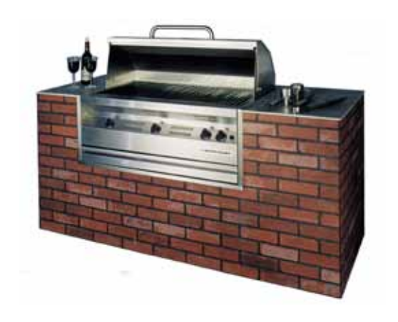
SGC-36BI* with SGC-H36 Smoke Hood option and *optional custom surround