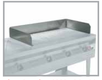
Stainless Steel Windshield