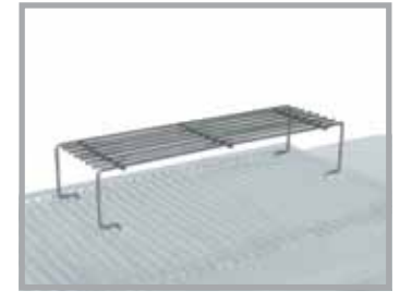
24 WR Stainless Steel Warming Rack