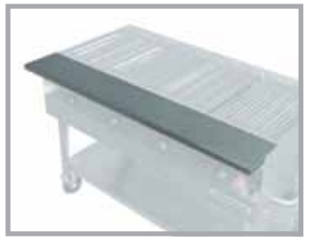
Stainless Steel Front Shelf