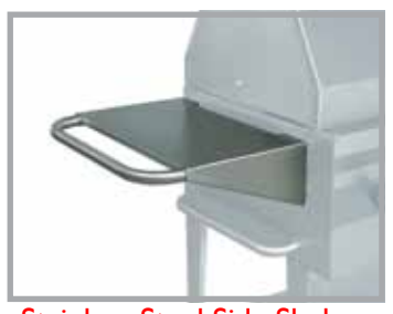
Stainless Steel Side Shelves

Enhance your grilling experience with the SILVER GLANT . Accessories Collection