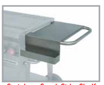
Stainless Steel Side Shelf with Sauce Tray